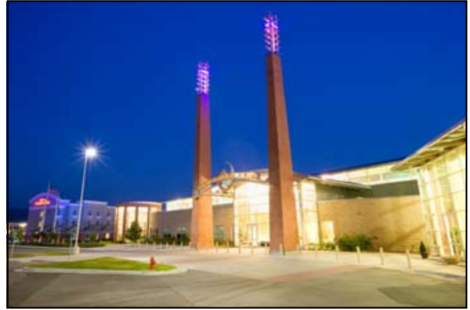
The Davis Conference Center and Hilton Garden Inn are surrounded by many restaurants and shopping centers.

The Davis Conference Center is attached to the Hilton Garden Inn , providing every comfort you can imagine. The conference rate for this luxury hotel is $92/night, plus tax. This rate is only guaranteed through October 15th . You may make your reservation online at www.preventchildabuseutah.org/annualconference.html , or by calling 801-416-8899 or 1-877-STAYHGI . Please reference the code Prevent Child Abuse Utah to receive the discounted rate.